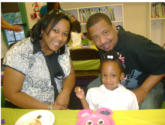
CDSA hosted Breakfast With Buddies on September 7th & 8th.

Parents, friends and families joined their favorite buddy for breakfast!